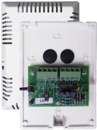
Part # MCS-HUMD-II-OVR Pictured with Override Button